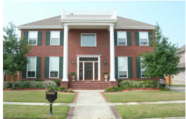
4413 Rue St. Peter $679,000

204 Moss Bayou - $559,000 4009 Turtle Bayou - $415,000 3304 E. Catahoula Ct. - $219,000 3252 E. Lafourche Ct. - $214,900 - Sale Pending 3332 Grandwood - $150,000 - Sold in less than 24 hours! 4413 Rue St. Peter - $679,000 - Sold 439 Belleville - $249,000 - Sold Please visit www.WendyHinyub.com for an updated list